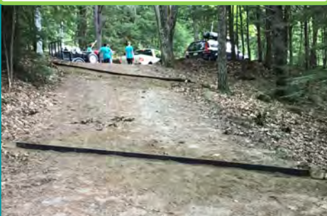
Rubber Razor Driveway Diverters Lovell Lake