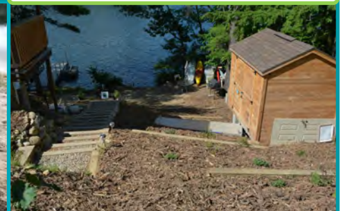
Waterbars, Erosion Control Mulch & Native Plants Great East Lake