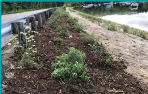
Erosion Control Mulch & Native Plants Province Lake